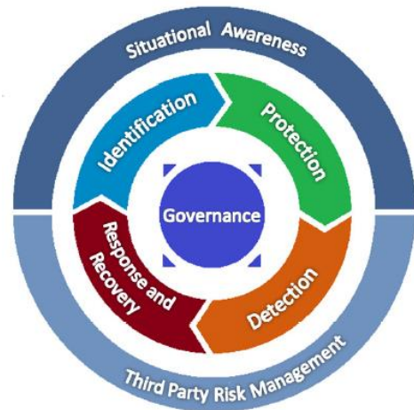
7 domains of the maturity assessment

Intelligence-led Cyber Attack Simulation Testing (iCAST) – A test of the AI’s cyber resilience by simulating real-life cyber attacks from adversaries, making use of relevant cyber intelligence. AIs with an inherent risk level assessed to be “medium” or “high” are expected to conduct the iCAST within a reasonable time.